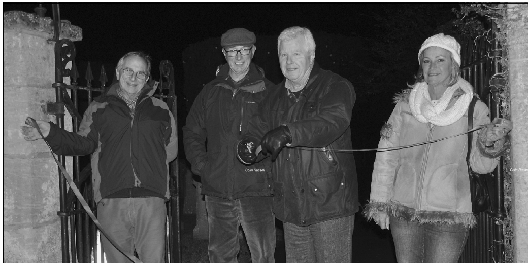
Switching on the Christmas Lights